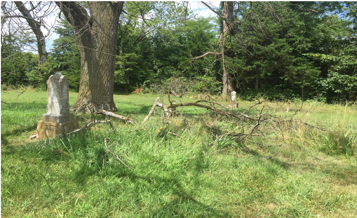
Briscoe Cemetery dead trees to be removed