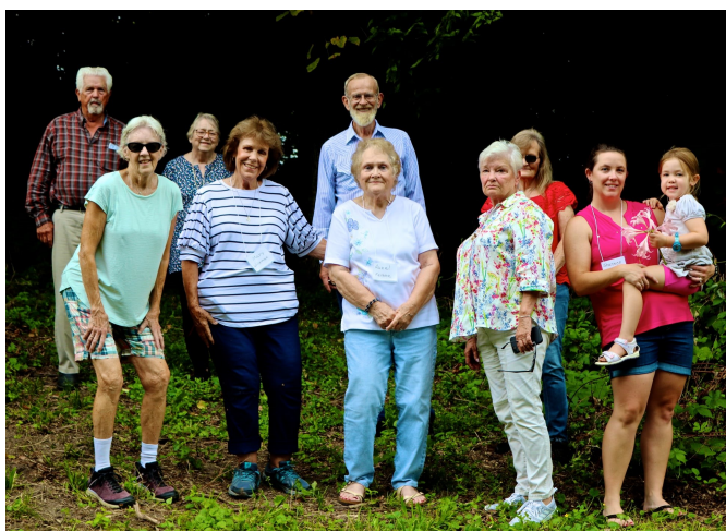
Standing on the bluff overlooking the river