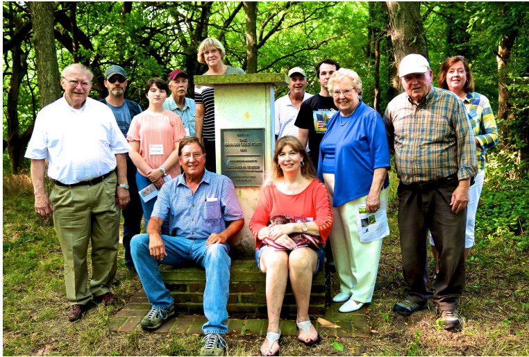
The Hannah Cole Fort Monument